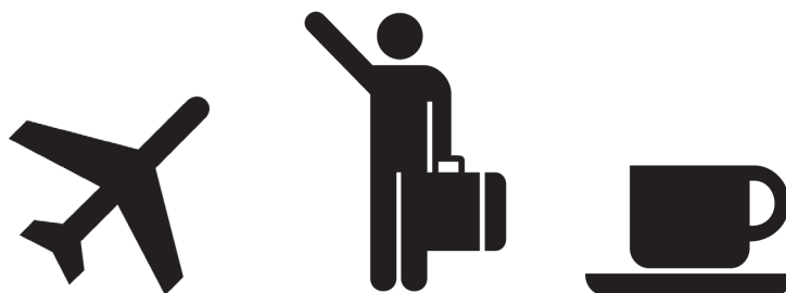
Fig. 2.2 Symbols developed by AIGA for the US Department of Transportation.

Systems such as musical and mathematical notation have been characterized as semasiographic , literally, ‘writing ideas’ (Gelb, 1952, p. 11). General-purpose writing, in contrast, has been called glottographic , literally, ‘language writing’ (Pulgram, 1976, p. 4). The distinction between the