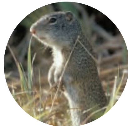
Franklin's Ground Squirrel