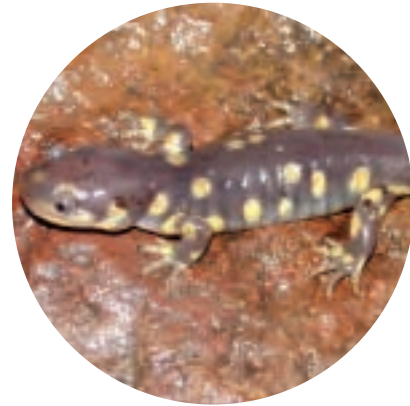
Eastern Tiger Salamander

Ebonysshell • Hickorynut • Rock Pocketbook • Wartyback • Elusive Clubtail • Blacknose Shiner • Blue Sucker • Brassy Minnow • Central Mudminnow • Flathead Chub • Ghost Shiner • Mooneye • Pallid Sturgeon • Plains Killifish • Plains Minnow • River Darter • Sturgeon Chub • Topeka Shiner • Trout-perch • Western Sand Darter